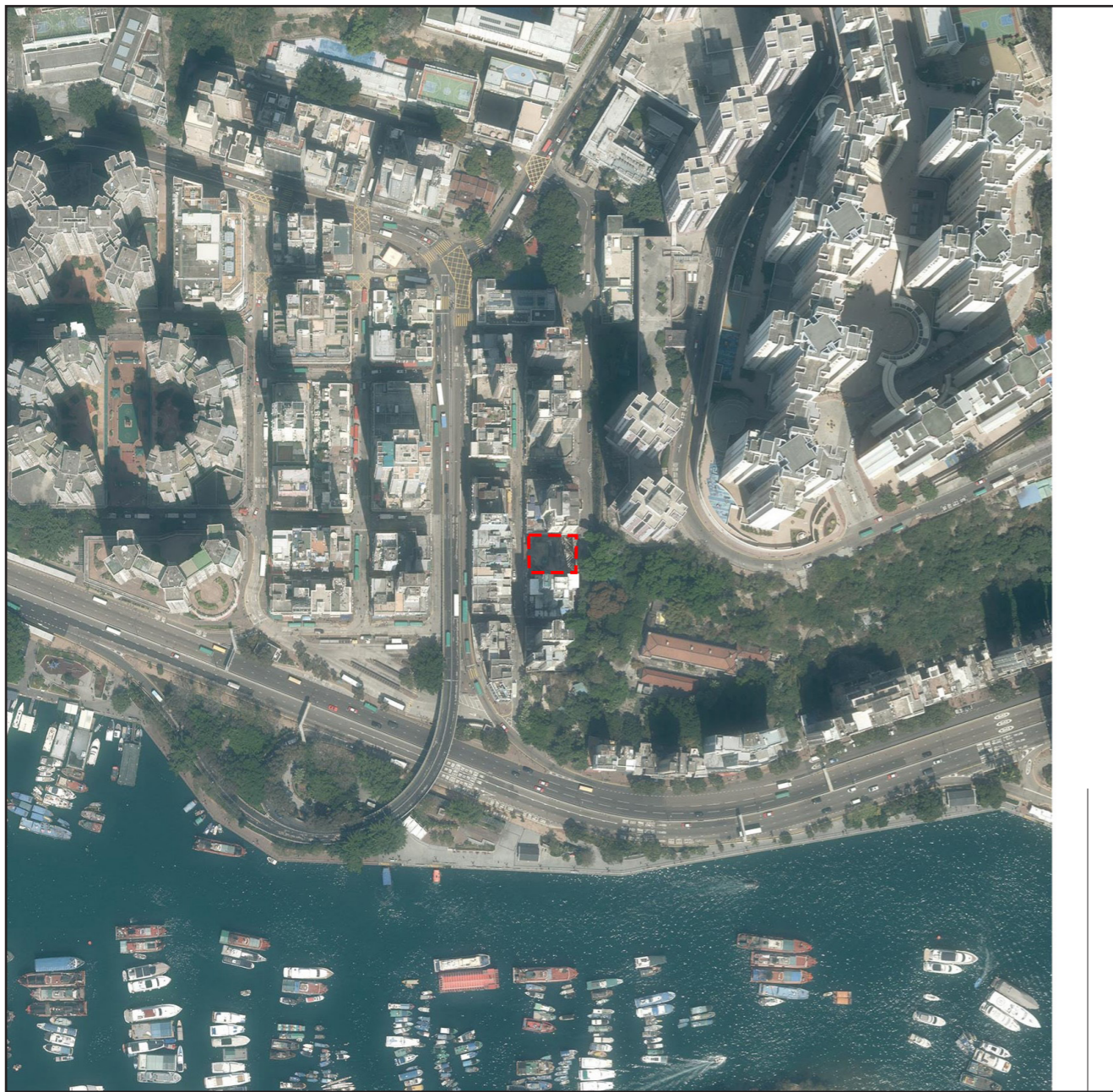
鳥瞰照片並不覆蓋本空白範圍 This blank area falls outside the coverage of the aerial photograph